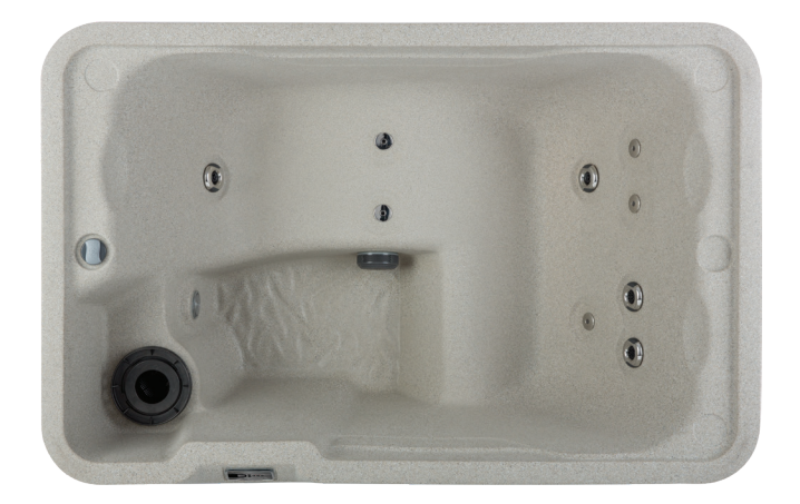
Mini shown in Sand