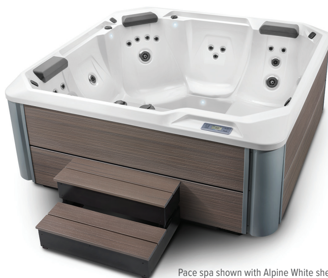
Pace spa shown with Alpine White shell, Havana cabinet and Havana Hot Spot Collection Step.